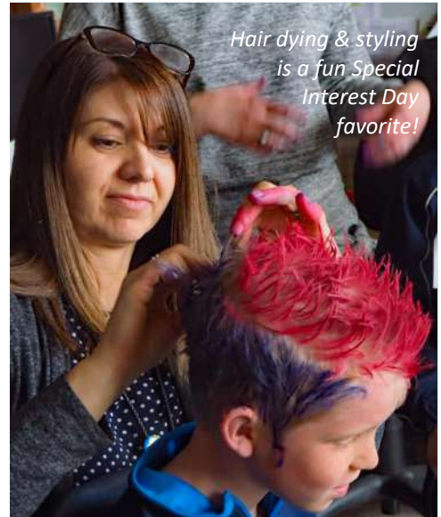
Hair dying & styling is a fun Special Interest Day favorite!