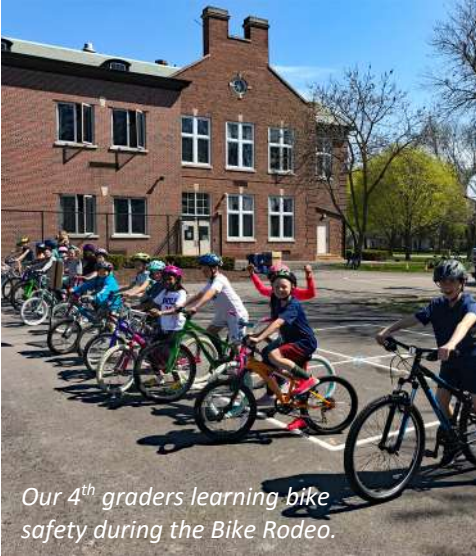
Our 4 th graders learning bike safety during the Bike Rodeo.