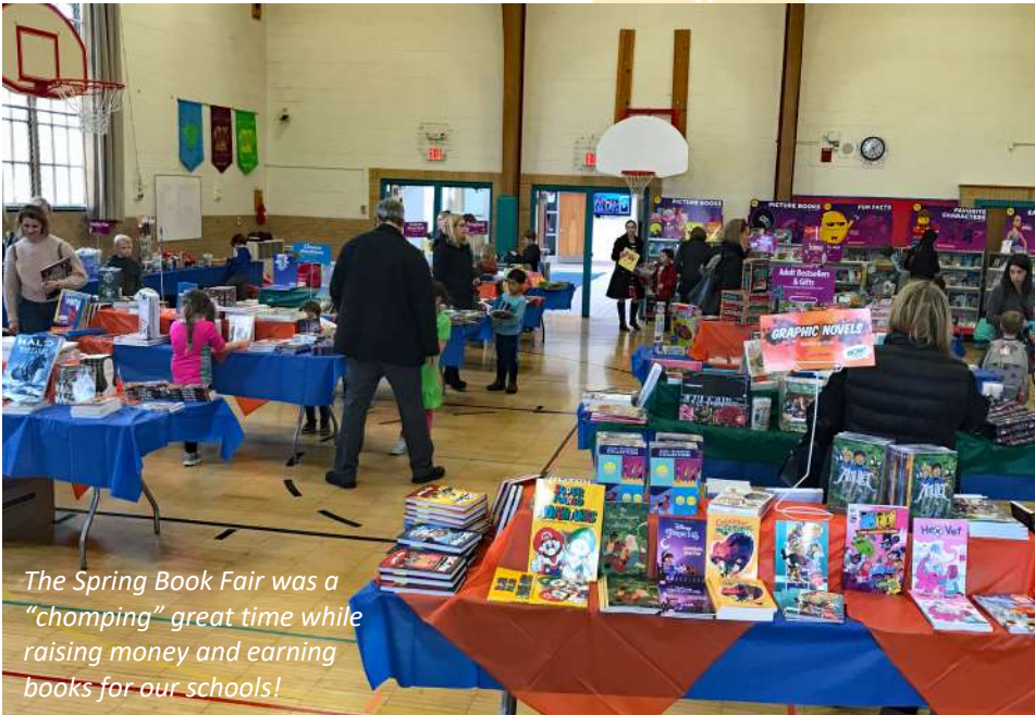
The Spring Book Fair was a "chomping" great time while raising money and earning books for our schools!