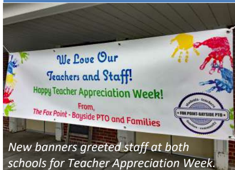
New banners greeted staff at both schools for Teacher Appreciation Week.