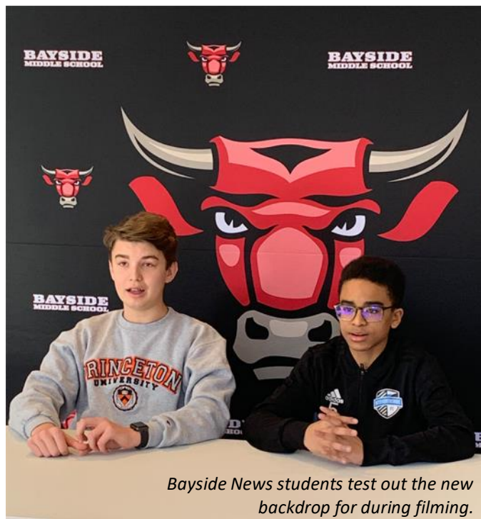
Bayside News students test out the new backdrop for during filming.

Teachers at both schools continue to benefit from the money raised at our Scholastic book fairs, so please support the online spring book fair starting this Monday, May 11th.