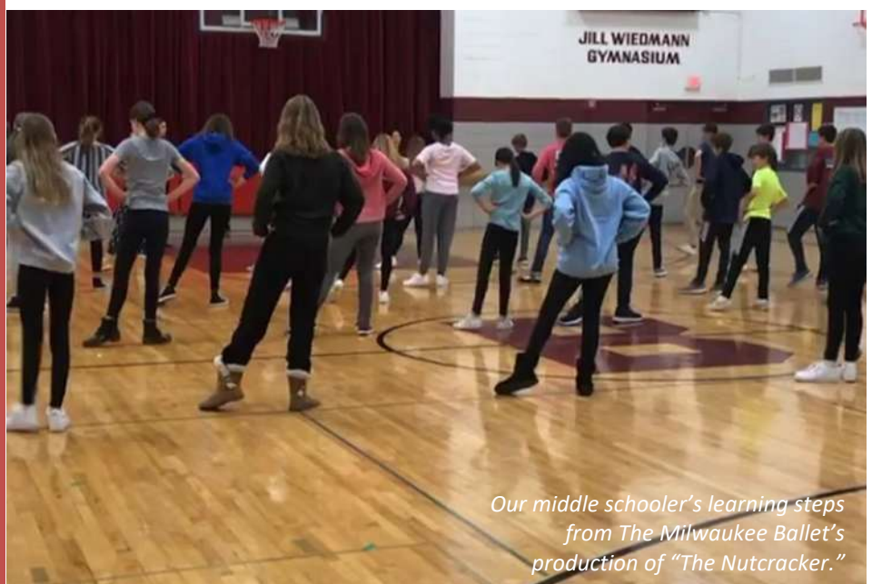
Our middle schooler's learning steps from The Milwaukee Ballet's production of "The Nutcracker."

Stay tuned this upcoming season for many more creative opportunities through Bayside Middle Schools' Cultural Arts and Sciences Committee.