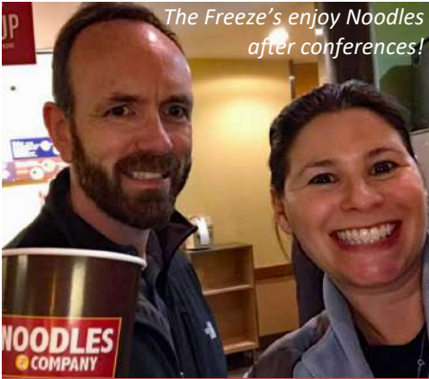
The Freeze's enjoy Noodles after conferences!