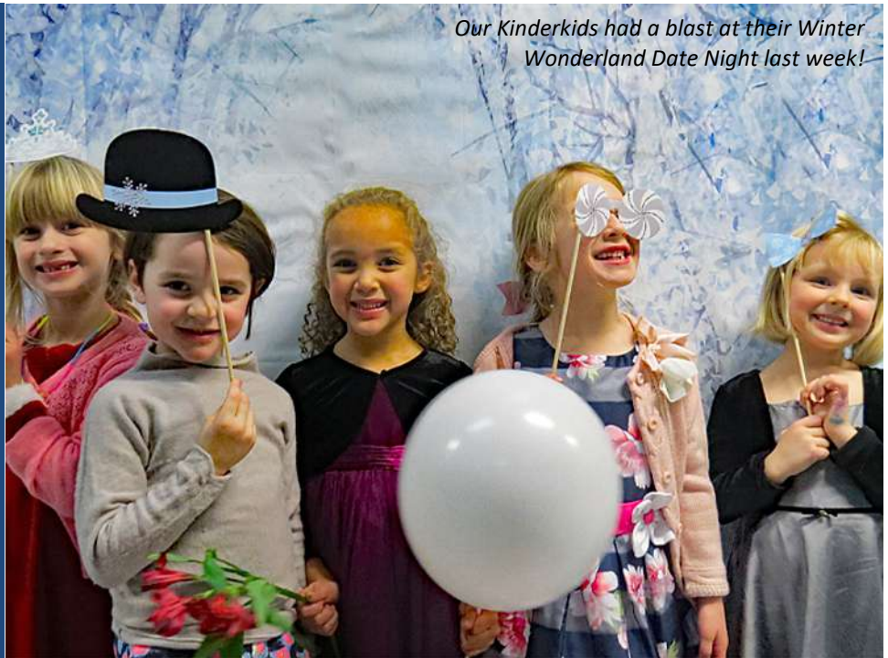
Our Kinderkids had a blast at their Winter Wonderland Date Night last week!