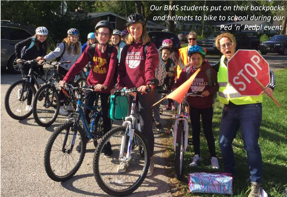
Our BMS students put on their backpacks and helmets to bike to school during our Ped 'n' Pedal event.