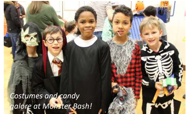
Costumes and candy galore at Monster Bash!

It's really hard to believe that it is already December and that we are ready to head off for Winter Break! All of the chair people on Ways and Means have been busy working away to create fun and exciting ways to raise funds. Here's the rundown of what we have been up to.