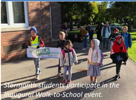
Stormonth students participate in the Inaugural Walk-to-School event.