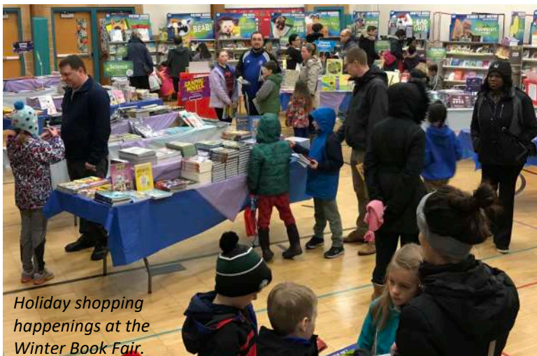
Holiday shopping happenings at the Winter Book Fair.