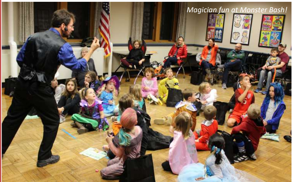
Magician fun at Monster Bash!