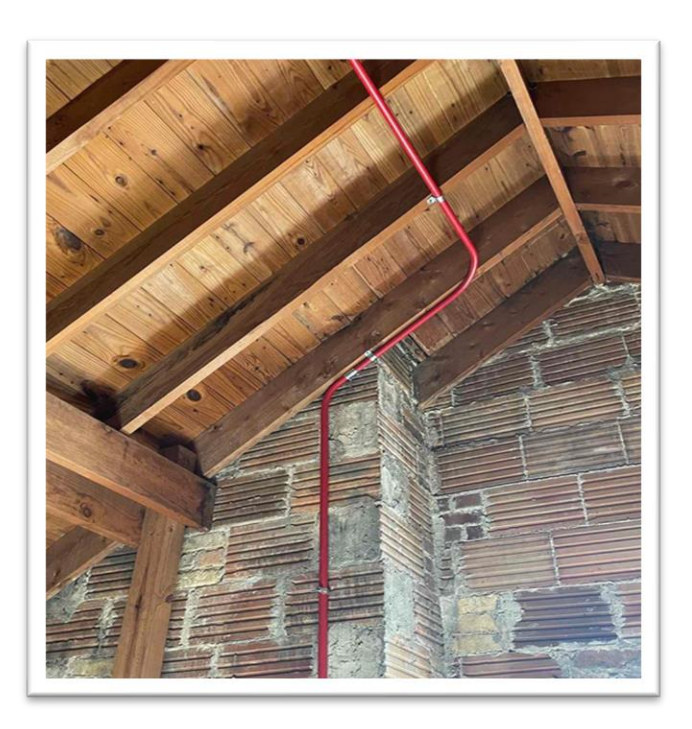
The sprinkler system is being installed in the attic.