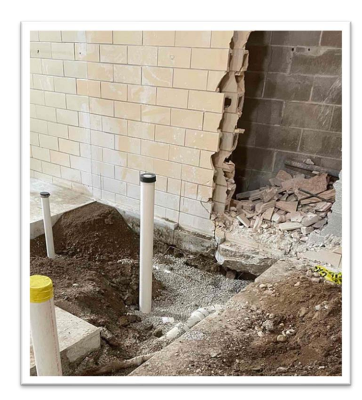
Demolition in the locker room for new plumbing rough-ins.