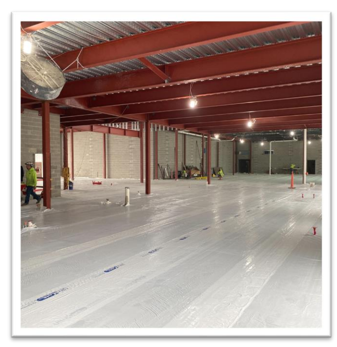
Concrete slabs were poured in the Commons Area.