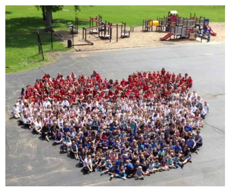
We Love Stormonth School!