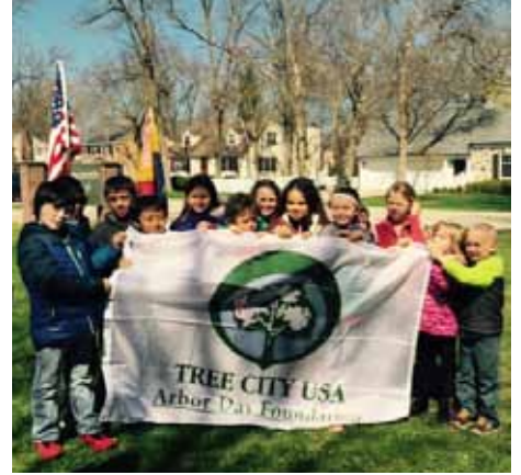
Arbor Day Celebration at Stormonth