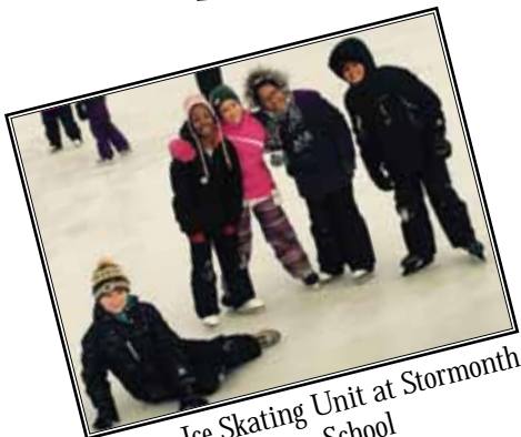
Ice Skating Unit at Stormonth Elementary School