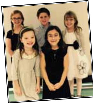
Stormonth Elementary Community Night Grade Level Speakers