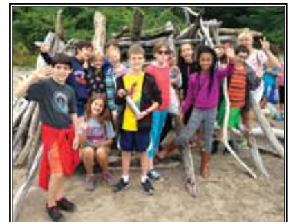
BMS 5th graders explore the shores of Lake Michigan at Doctor's Park.