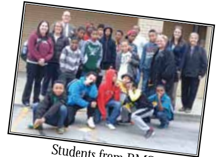
Students from BMS attended the UWM Black Male Youth Summit