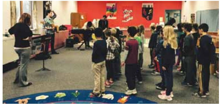
School of Rock performance