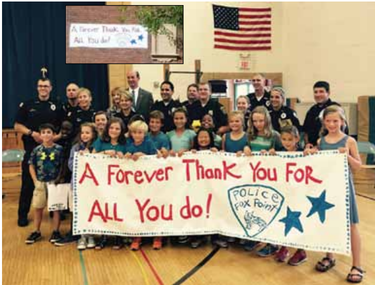
"Thank a Police Officer" assembly.