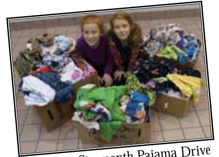
Stormonth Pajama Drive