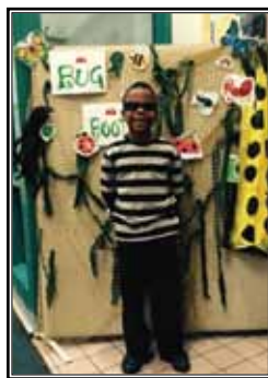
A Stormonth BUG (Being Unusually Good) Picture in the Bug Booth