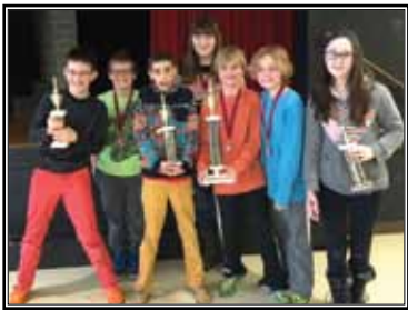
The talented BMS Chess Club is dominating tournaments throughout the Milwaukee region.