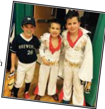
Monster Bash at Stormonth Elementary School