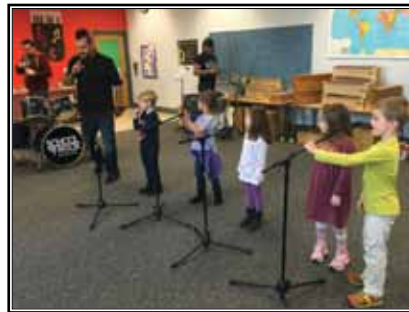
Music Concerts with the School of Rock at Stormonth Elementary School