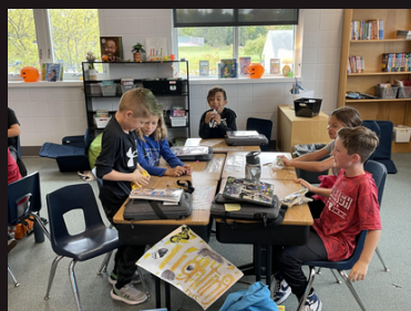
Third Grade Students discuss the effects of bullying through the crumpled paper activity.