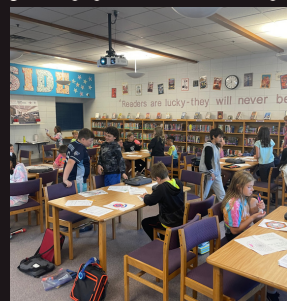
Fifth Grade Students setting S.M.A.R.T. Goals.