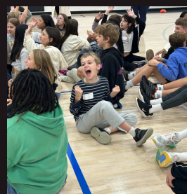
The energy and excitement was second to none during our 7th Grade Courage Retreat!