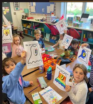
First Grade Students learning how to be an upstander when they witness bullying.