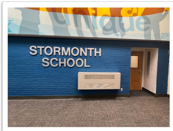
The front entryway is complete.