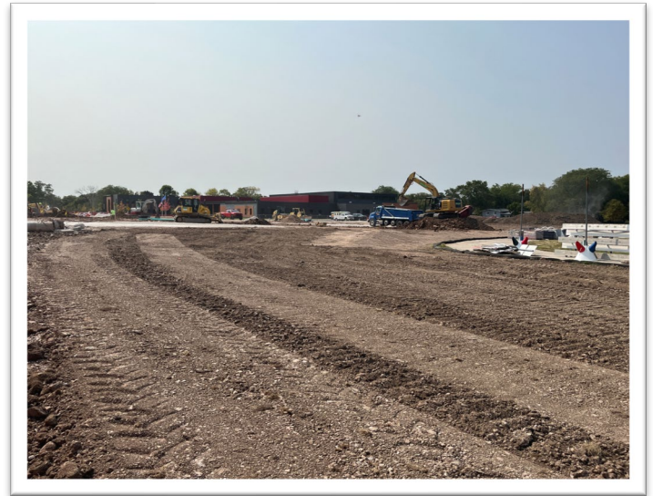
Work on the athletic fields is underway.