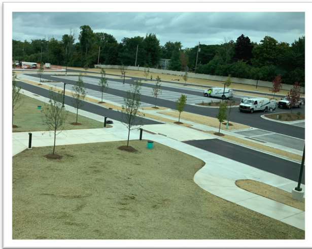
New parking lot and traffic configuration.