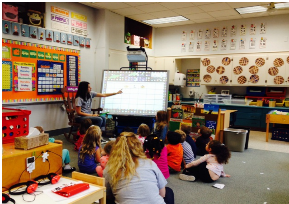
SMART BOARDS IN USE AT STORMONTH ELEMENTARY SCHOOL KINDERGARTEN