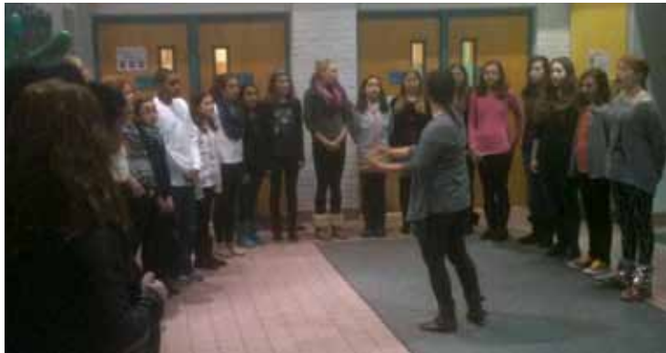
The Bayside Chamber Choir performed for the School Board at the start of the February 16th Regular Board Meeting.