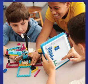
Advanced LEGO with Spike

Please go to our website for prices and options. GreaterMilwaukee.ClubSciKidz.com