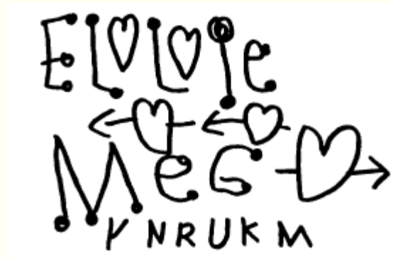
4-5 years old

I will mes you. I rile dot onet you to lev. I Love you So mich. But I hoq you have a grat tim.