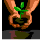
PALS (Peers Acquiring Life Skills)