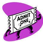
Brewers Academic Achievement/Effort