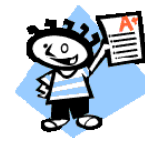
End-of-Year Student Awards Assembly (Academics, Athletics, Fine Arts & Community Service)